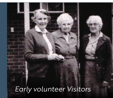
Early volunteer Visitors

Today, our Volunteers, both men and women who also form the Visitors' Committee, are assigned to specific sites within The Cottage Homes. Every month, they pay a friendly visit to residents who've asked for